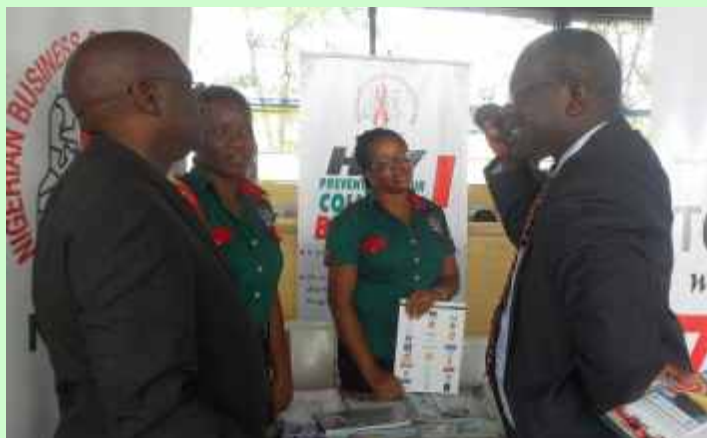
Visitors at NiBUCAA Stand at the Exhibition

displayed Information, Education and Communication (IEC) Materials to people and also educated on basics of HIV/AIDS and Malaria. There was a stand for the provision of Free Voluntary HIV Counseling and Testing coordinated by NiBUCAA.