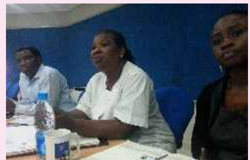
NiBUCAA and SHOPS visit to Nestle, Lagos