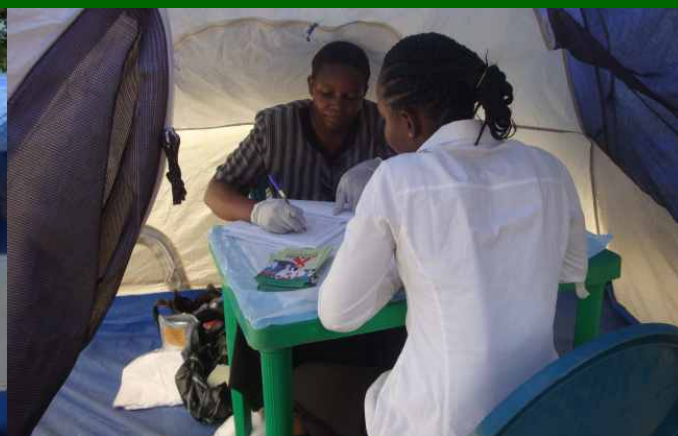
A typical HCT session

the National Association of the Blind, at Ojuelegba, Lagos, on May 4.