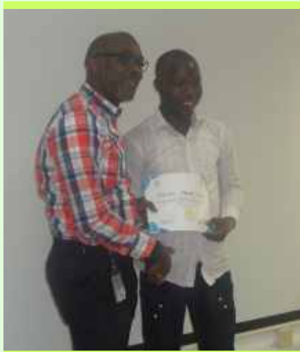
Presentation of certificate to a trained PE at Unilever

T wo NiBUCAA staff have decried workplace HIV stigma and discrimination (S&D), adding that people living with HIV (PLHIV) can live productive lives with the support of their peers.