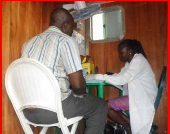
A delegate trying to know his HIV Status

A Private Health Sector Trade Fair was organised by SHOPS-Strengthening Health Outcomes through the Private Sector on April 24, 2013. The fair was held at Lagos Television (Blue Roof). It was to encourage those in the Health