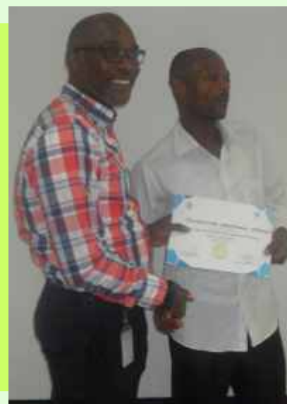
Another trained PE receiving his certificate

She also stressed that condoms should be used correctly and