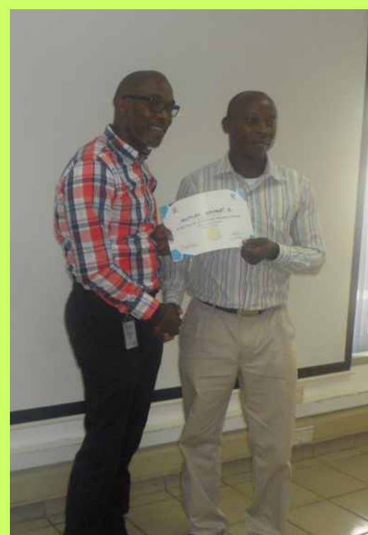
Presentation of certificates to trained PEs at Unilever