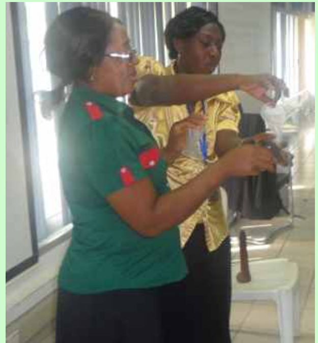
NIBUCAA's PO and one of the participants doing a condom demonstration