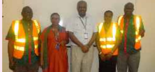
NiBUCAA visit to Dangote Sugar PLC