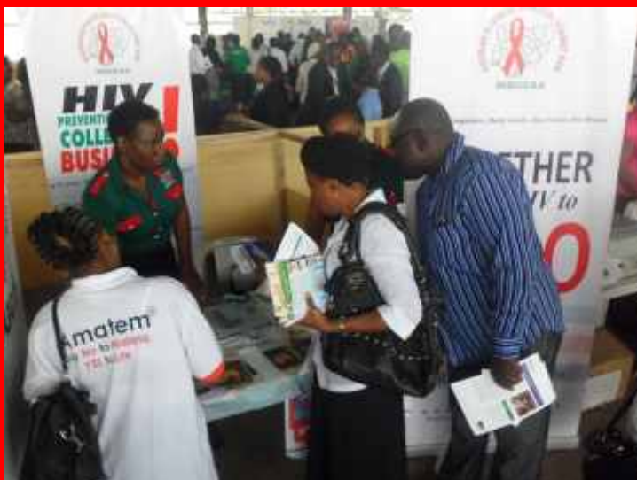
Visitors taking IEC materials at NiBUCAA Stand