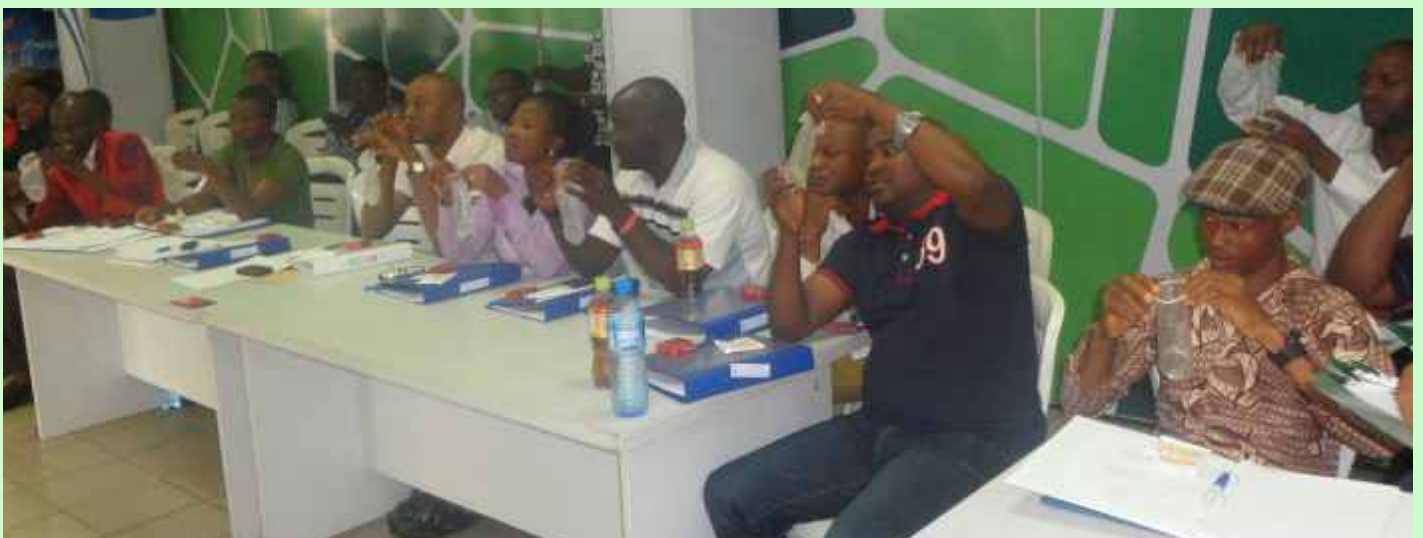
Participants during condom demonstration session